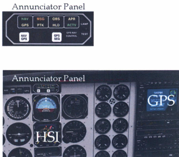
Figure 9.5: Typical Stand-alone GNSS installation

An annunciator panel is standard equipment for approach operations and must be located in a suitable position on the instrument panel. Navigation mode annunciation of terminal mode, approach armed, and approach active is required.